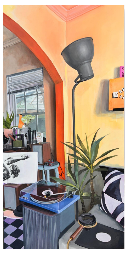
Jurell Cayetano, Living Room, 36 x 72 inches Oil, gouache, color pencil, and carbon pencil on paper mounted on wood

Artist Talk: Saturday, Aug. 19, 3 pm Exhibition Dates: Aug. 3 - Sept. 7, 2023